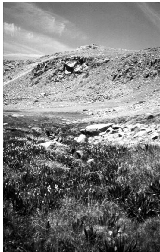
Figure 115—McAfee, McAfee Meadow , where the dominant species are Deschampsia cespitosa , Carex incurviformis , and Carex heteroneura . (S. Cheng 2000)

Trifolium andersonii : This community is distributed on the tops of plateaus, W. of the Carex sp.- Eriogonum ovalifolium community and at the easternmost end of the plateau in the central portions of the study area. These areas are flat and relatively dry, shielded